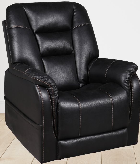
Shown in Badlands (Eclipse)